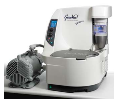
The Scroll pump used with the EZ-2 Elite delivers deeper vacuum than the diaphragm pumps found in the EZ-2 Standard, Envi and Plus.